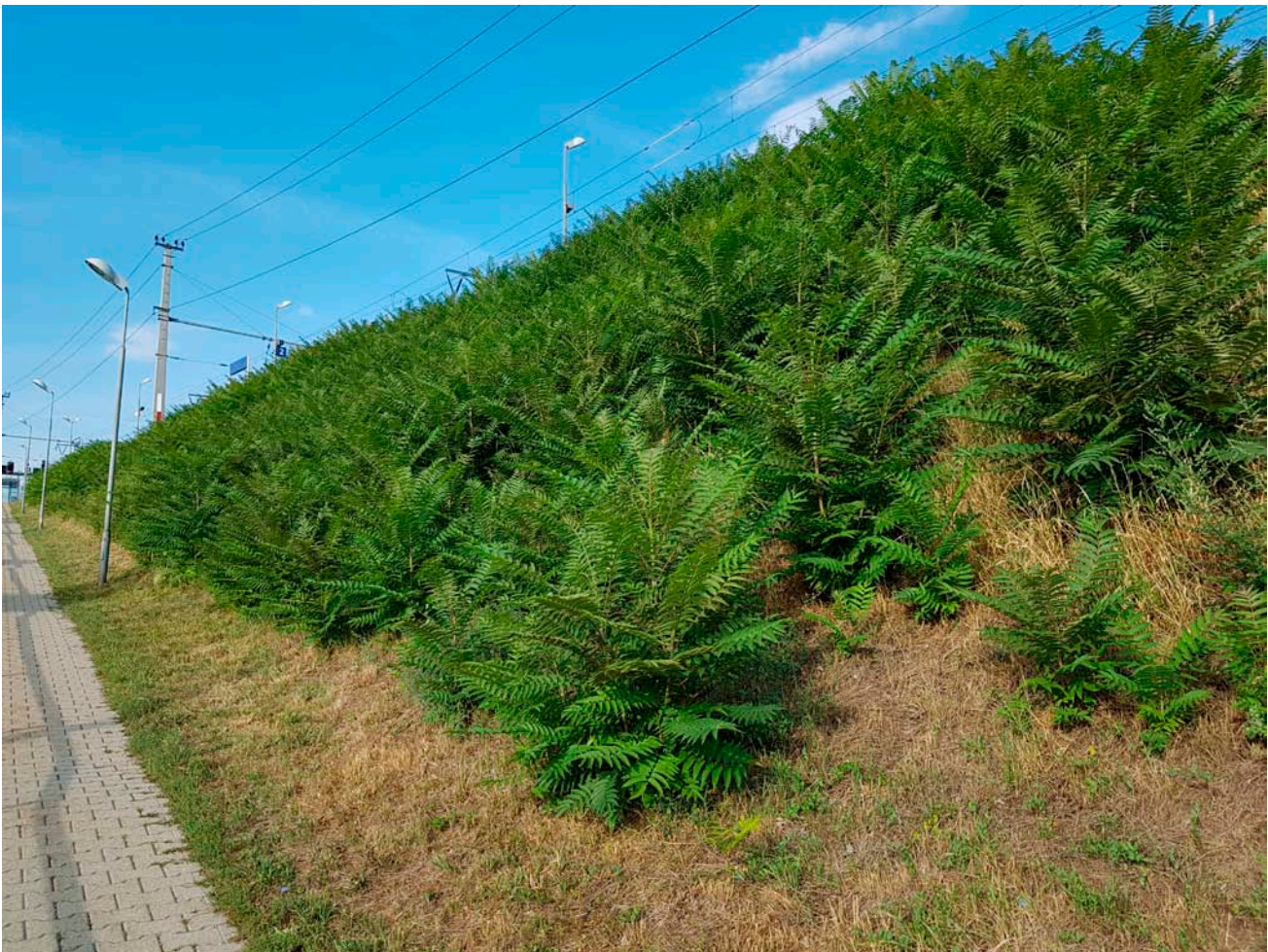
Ailanthus altissima .

Several measures do exist and would be very effective if included in a dedicated plan. However, such a dedicated plan should be based also on the knowledge of the actual distribution and abundance at MS level, at least with the resolution of a 10 × 10 km grid map (or even lower for some priority sites). Such important baseline mapping dataset is presently not available, so that the precise evaluation of efforts and resources required for ED in areas not yet invaded by Ailanthus in the EU is not possible.