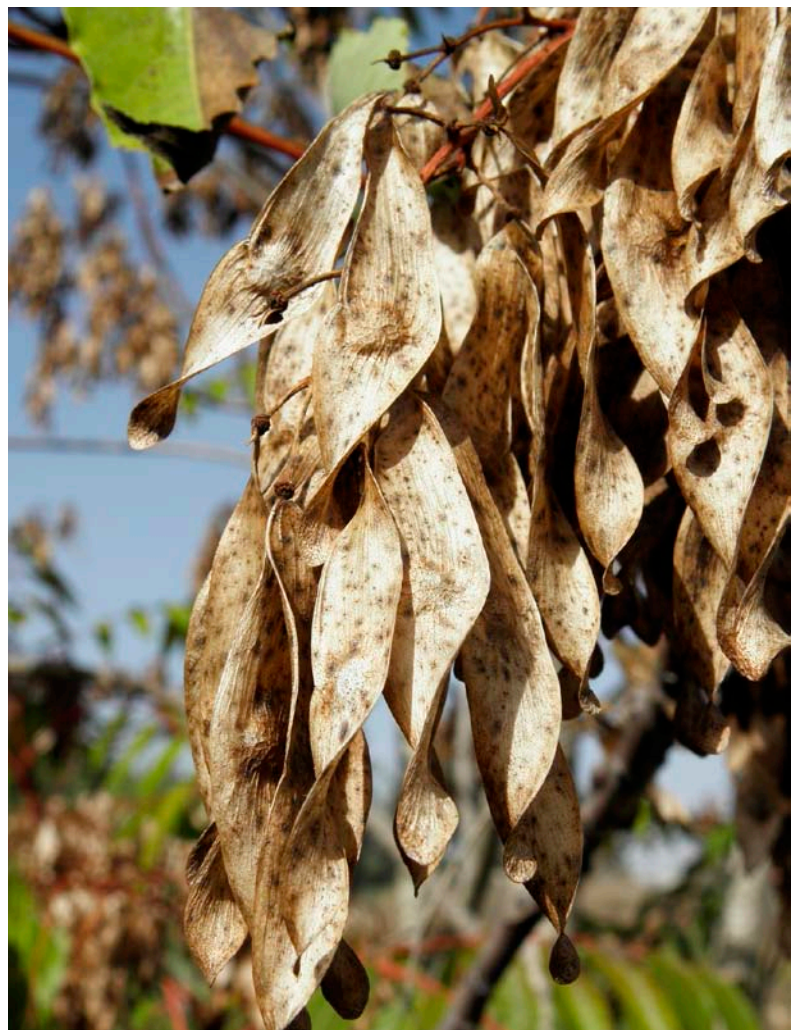
Ailanthus altissima .

There are a number of best practice guidance documents published. Prevention is the first and most cost-effective line of defence against invasive alien species. In conclusion, the preventive measures summarised in the present section and described in the following sections (with a high level of confidence due to the fact that Ailanthus is quite a well-studied species) are very likely to limit the spread of Ailanthus to areas of the EU where the species is presently absent or where it has been locally eradicated. Road and railways are very well-known transport corridors for Ailanthus accidental spread.