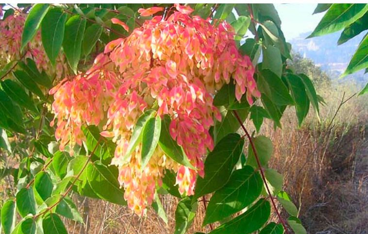
Ailanthus altissima .