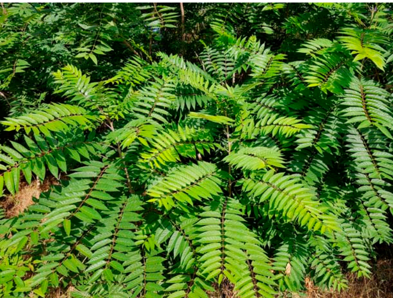
Ailanthus altissima .

paper obtained from Ailanthus are close to those of the reference ones ( Eucalyptus globulus ).