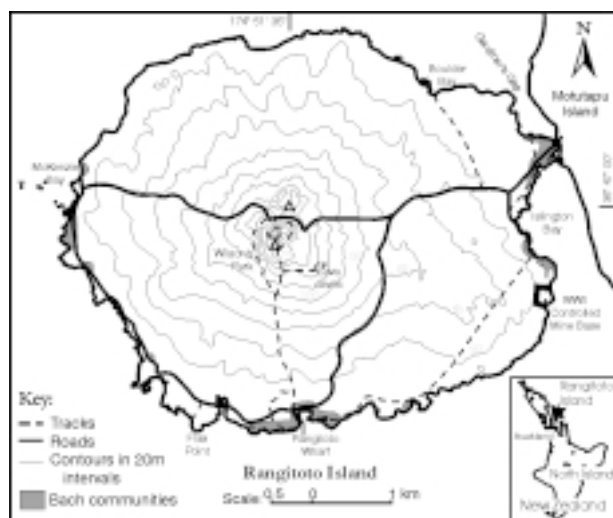
Fig. 1 Location and features of Rangitoto Island.

The forest structure and species associations found in the native vegetation on Rangitoto identifies more closely with the forests of the volcanic Big Island of Hawaii than with any other forest type in New Zealand. The canopy of the Rangitoto forests, like their Hawaiian counterparts, are dominated by trees of the genus Metrosideros (Myrtaceae).