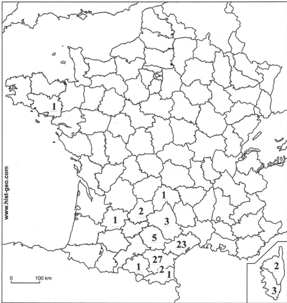
Fig. 1. Map showing the départements from which samples were collected, and the number from each. The two samples between Aude and the Pyrénées-Orientales were collected on the boundary between the two départements. In addition, 5 samples were collected from Guadeloupe and 9 from the Kerguelen Islands.

examined frequently at intervals of a few days, with a \times 7 - 45 magnification stereomicroscope. Fruiting bodies were removed and mounted in water for examination and identification at higher magnification. Samples were mostly incubated for up to 22 wk (exceptionally for one sample for over a year), with observations continuing whilst new fungi were being observed. Sample locality coordinates (latitude and longitude) for most were determined with a Magellan GPS 4000 XL or eXplorist 100 GPS unit; those for Corsica and the Kerguelen Islands were obtained by using Google Earth and the locality details provided by the collectors. Selected material has been placed in the Herbarium of the Royal Botanic Garden, Edinburgh ( E ). In considering diversity, a cumulative species