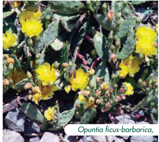
Opuntia ficus-barbarica ,

The St Louis set of Codes developed out of a meeting of representatives from the nursery industry, botanic gardens, landscape architects, the gardening public and government in St. Louis, Missouri, USA, in 2001 to develop codes of conduct. The codes were intended as voluntary guidelines, or best management practices, for the prevention of the introduction and spread of invasive plants. The code for botanic gardens is reproduced in Annex 4.