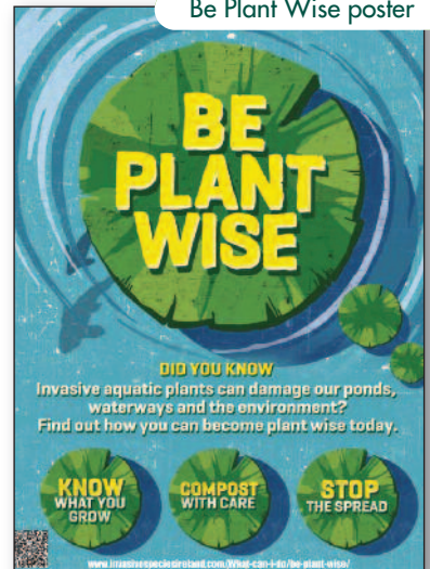
Be Plant Wise poster

The Seed List or Index Seminum is one of the defining characteristics of a botanic garden. Given that the purpose of a Seed List is to make seed and other propagules of plants grown in the botanic garden or collected in the wild available to other botanic gardens by exchange, this has effectively created a network of botanic gardens and other scientific institutions in many parts of the world. It also provides, unintentionally, a mechanism for the spread of alien invasive plants and some European botanic garden seed lists actually offer freely seed of