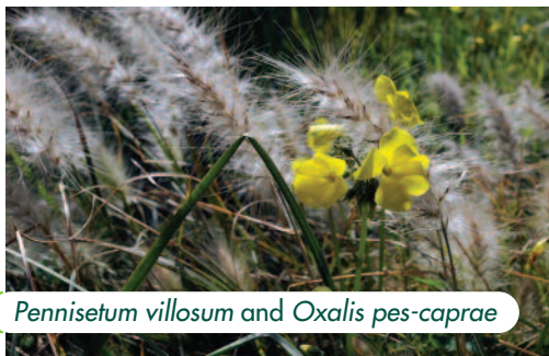
Pennisetum villosum and Oxalis pes-caprae

risk (Heywood, 2011a; Bradley et al. , 2012). Ironically, the very characteristics that make some species attractive for introduction (ease of propagation, fast-growing, adaptable, high reproductive output, resistance to pests and diseases, tolerant of disturbance and a range of environmental conditions) are the same properties that increase the likelihood of the species becoming invasive. Risk assessment strategies may need to be adapted to address this new type of threat.