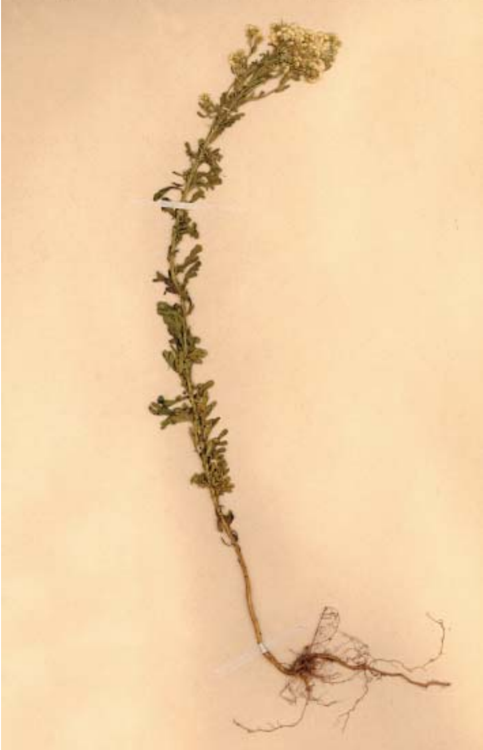
Fig. 2. – Conyza triloba Decne. Flora Bohemica: Distr. Blatná [recte Strakonice], ad piscinam prope vicum Černivsko. V. 1971, leg. M. Deyl (PR).