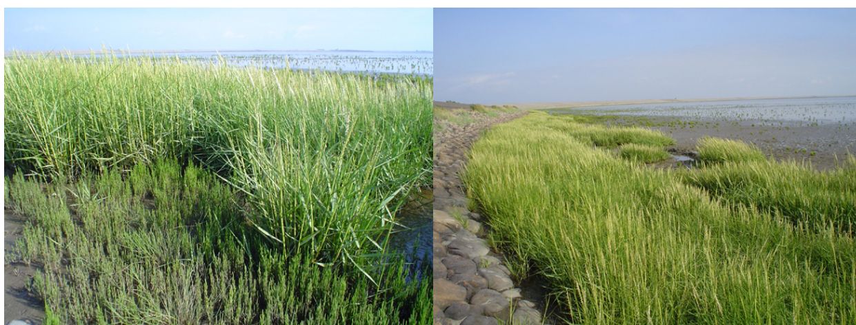
Fig. 1. Spartina anglica (at the back) displaces i.a. the native glass-wort Salicornia stricta (in the foreground): Wadden Sea of Schleswig-Holstein near Eider estuary, Germany, August 2004, photo by Stefan Nehring. Fig. 2. Spartina anglica sward: Wadden Sea of Schleswig-Holstein near Eider estuary, Germany, August 2004, photo by Stefan Nehring.

Common names: Common cord-grass, English cord-grass, rice grass, salt marsh-grass (GB), Vadegræs, Hybrid-Vadegræs (only for the sterile hybrid) (DK), Englisches Schlickgras, Reisgras, Salz-Schlickgras (DE), Engels Slijkgras (NL), Marsk-gräs (SE), englannimarskiheinä (FI)