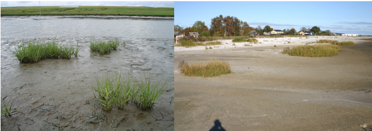
Fig. 3. Spartina anglica seedlings: Elbe estuary, Germany, August 2004. Fig. 4. Spartina anglica clumps on a sandy beach in a recreation area: Udbyhøj, Randers Fjord, Denmark, October 2005.