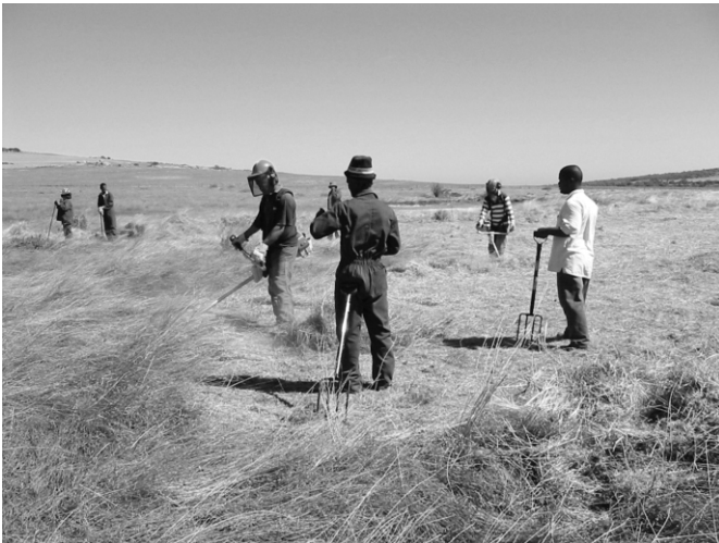
Fig. 3. A Working for Water team establishing alien grass removal experiments at the Tienie Versfeld Geophyte Reserve near Darling in the Western Cape. Grass was experimentally removed by hoeing, cutting, burning and the use of herbicides. The response of indigenous plants, particularly rare bulbs, will be compared among treatments.

(dubiously indigenous but probably of Mediterranean origin) dominated sites with reduced perennial shrub cover and herbaceous diversity. 44 Although it has been inferred from these studies that dense stands of grasses appear to pose a direct threat to the growth and reproduction of indigenous annuals and geophytes through competition, the hypothesis remains to be tested. At this stage it is uncertain how indigenous species and life-forms are responding to the novel cocktail that includes altered grazing and fire regimes, fragmentation, nutrient enrichment, alien grasses, climate and atmospheric change. There is also debate as to whether the colonization by annual alien grasses of areas cleared of woody legumes should be viewed as an asset or a hazard. Given adequate rain for their germination, these plants provide rapid cover following clearing or burning of alien wattles ( Acacia species), 51 controlling soil movement, possibly out-competing wattle seedlings and changing the appearance of denuded landscapes. On the other hand, it is possible that they might be reducing the survival of the few indigenous plants that emerge from seed-banks long suppressed by woody invaders.