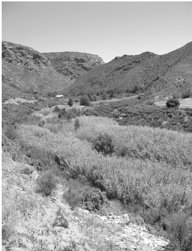
Fig. 1. A dense stand of Spanish reed ( Arundo donax ) in the Huis River, between Oudtshoorn and Calizdorp in the Little Karoo. Such stands can change hydrological processes and may increase transpiration.

tendency to form dense stands on riverbanks (Fig. 1), Spanish reed also has potential to alter stream hydrology and sedimentology, to increase fire intensity, 10 and to reduce the diversity of riparian fauna and flora. Another grass that exploits an unstable habitat and moving water for dispersal is marram. This grass was widely planted on the South African coast to stabilize damaged dunes. 9 During high tides, viable rhizomes of this species can wash out of the sand and be transported hundreds of kilometres by near-shore sea currents. 17